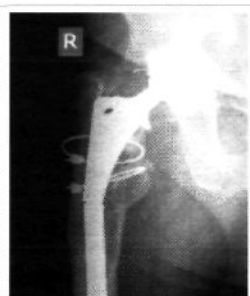
Figure 1: X-ray showing fractured stem. Note the poor proximal bone support. The visible clips were present from the primary surgery and were used to tag the abductor repair