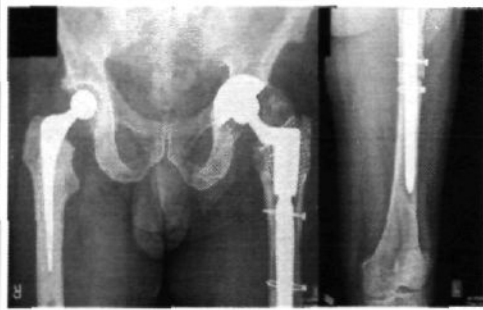
Figure 7: Case 3: Magnified view of the same radiograph showing the fractured stem