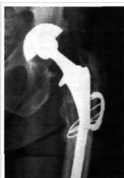
Figure 3: Case 2: Radiograph showing fracture through an Echelon™ stem just distal to the extended trochanteric osteotomy site