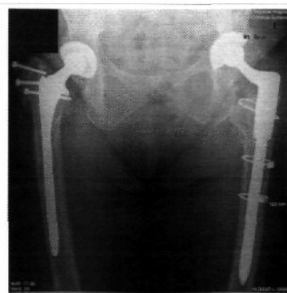
Figure 4: Case 2: Post-operative follow-up radiograph

Smaller stems in particular are at a greater risk of fracture as the bending moment of a homogenous cylinder is inversely proportional to product of the young's modulus of elasticity and its area moment of inertia. [7]