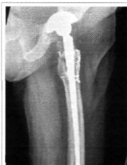
Figure 5: Case 3: Full-length radiograph showing fracture through distal third portion of stem

An 82 year old presented to the outpatients departs with worsening difficulty while walking, increasing stiffness and pain