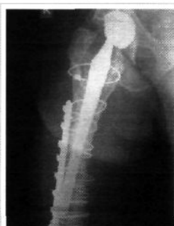
Figure 2: Case 1: Postoperative radiograph showing a cable plate applied to support a distal peri-prosthetic fracture